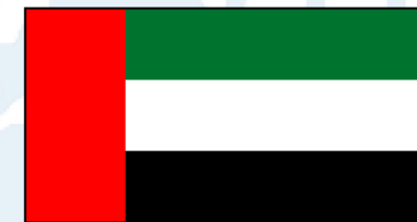
United Arab Emirates