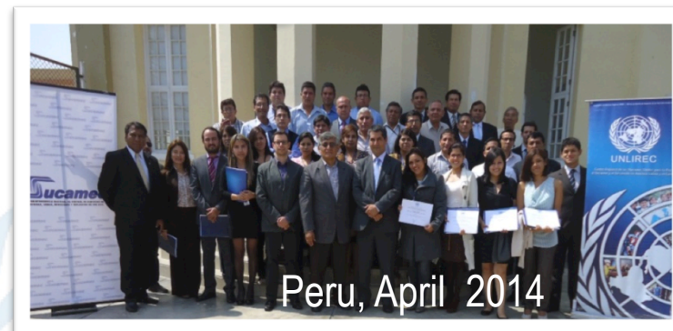
Peru, April 2014