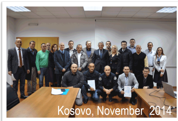
Kosovo, November 2014