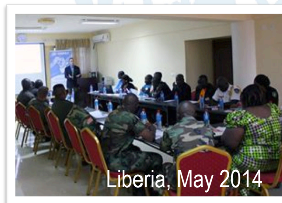
Liberia, May 2014