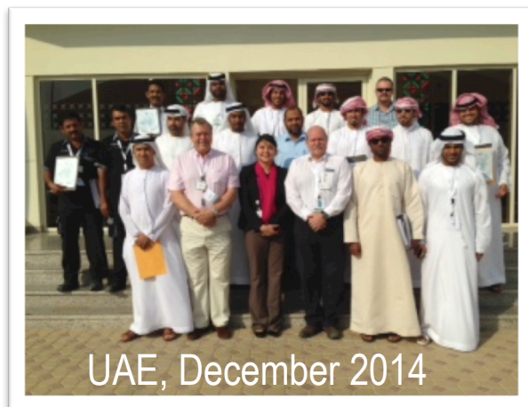
UAE, December 2014