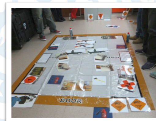
Sample tool used during training