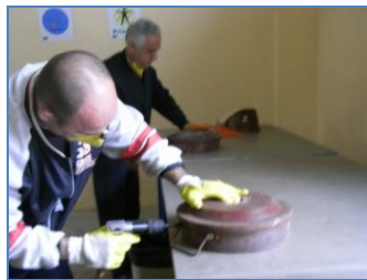
Removing mine handle