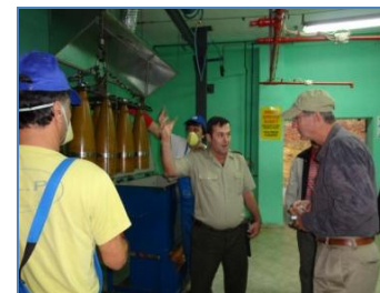
Large calibre autoclave