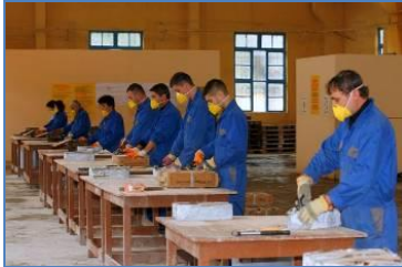
14.5mm processing line