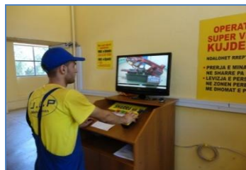
Cutting mortars by remote operation