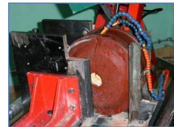
Cutting mine in half on bandsaw