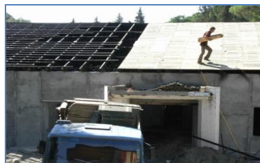
Utilisation of old wooden boxes for refurbishment