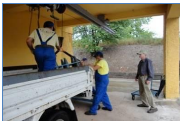
120mm mortar prepared for demil