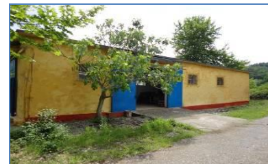
Driving band bldg after refurbishment