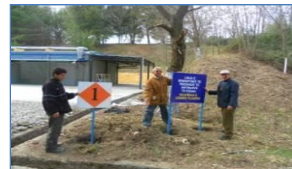
Explosive licensing compliance