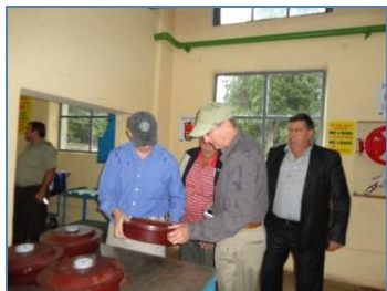
Anti-Tank mine demil line