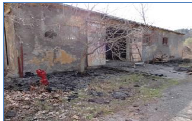
Driving band bldg before