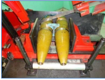
Large calibre being cut in half