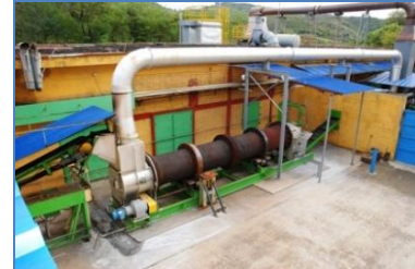
The EWI incinerator