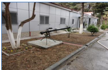
New Admin Building