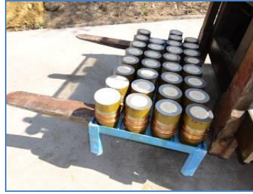
Large calibre after being cut in half