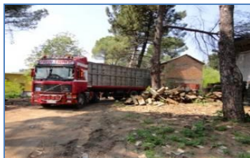
Removal of combustible material