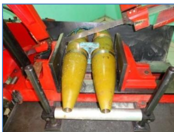
Large calibre being cut in half