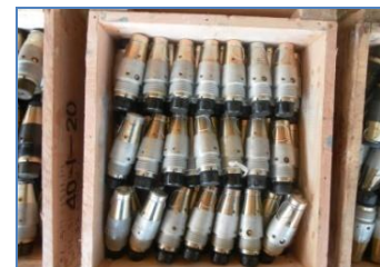
Fuzes ready for incineration