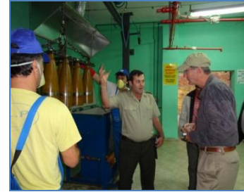
Large calibre autoclave