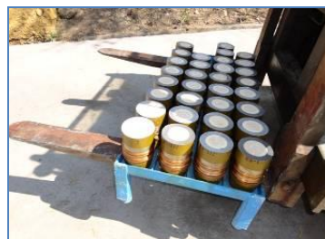
Large calibre after being cut in half