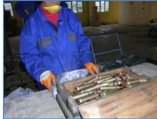
Preparing 14.5mm for the EWI